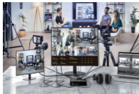
Production of programs